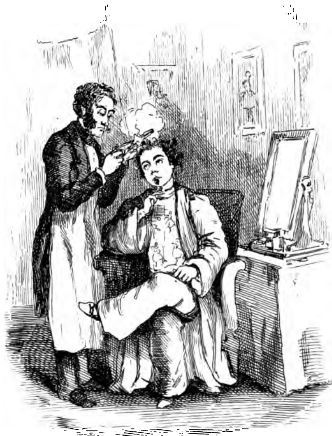
MR. FOKER PREPARING TO CONQUER